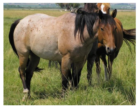
A bay roan Quarter Horse with typical "classic roan" traits: relatively uniform distribution of dark and white hairs over the body, dark head and legs. No white in mane and tail. Dark "corn marks" replace roan color where there have been minor skin scrapes.

The most strongly expressed rabicano horses are usually chestnuts, but rabicano has variable expressivity, sometimes as minimal as white or light hairs in the mane and tail. Rabicano is the pattern of Arabians usually registered as "roan," though some sabinos also have been described by their owners as "roan." However, according to Dr. D. Phillip Sponenberg, the classic roan pattern does not occur in Arabians. There are no genetic studies on rabicano to date, though the pattern is mentioned briefly in genetics textbooks, and it may be inherited as a dominant trait in some horse family lines.