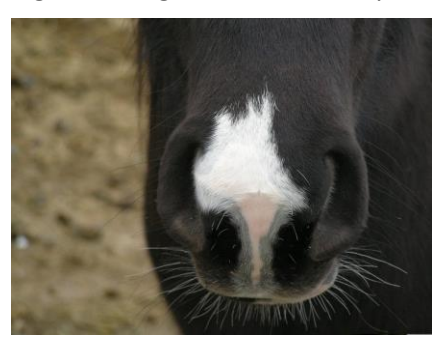
White markings extending onto the nostril and lower lip of this otherwise black purebred Arabian may represent a minimal expression of sabino.

10805 East Bethany Drive Phone 303-696-4500 Aurora, Colorado 80014 Fax 303-696-4599 www.ArabianHorses.org | info@ArabianHorses.org