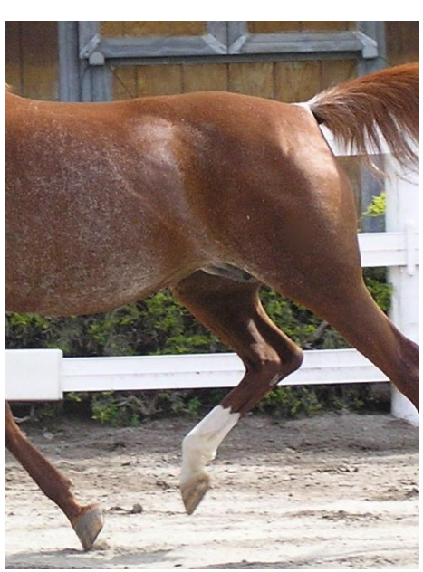
Detail of moderate rabicano traits on a purebred Arabian registered as a chestnut. Intermixed white hairs predominantly around barrel and flank, white "skunk tail" hairs at base of the tail.