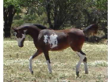
A purebred Arabian with vivid sabino markings.

Sabino in Arabian horses is one of the best-known Arabian coat color patterns, but difficult to define because there is considerable variation in markings. It is characterized by bold facial markings and high white leg markings, usually with irregular edges, and often extending above the knees and hocks. It may include white spotting extending up the legs onto the belly with an vertical or upward orientation. These markings may have roaning, freckled, or lacy edges. However, minimal expression of sabino genetics may be indicated by as