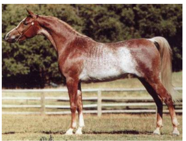
An extensively expressed rabicano Arabian.

Though sometimes called "roan," Rabicano differs from classic or "true" roan in several significant ways. A roan horse generally has intermixed light and dark hairs over its