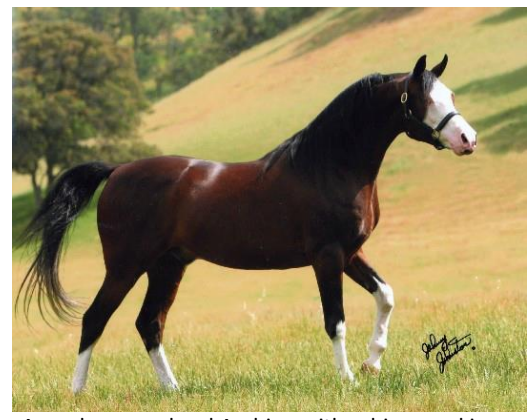
A modern purebred Arabian with sabino markings.

classified as sabino. She also noted that parti-colored horses existed amongst the Arabians owned by Abbas Pasha. The Crabbet stallion Mesaoud, imported from Egypt, had extensive white markings described in the Crabbet Arabian herdbook. His white facial markings, body spots, and white leg markings with irregular edges that extended onto his knees and hocks fit the modern definition of sabino.